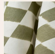
CHECKERBOARD IN GREEN